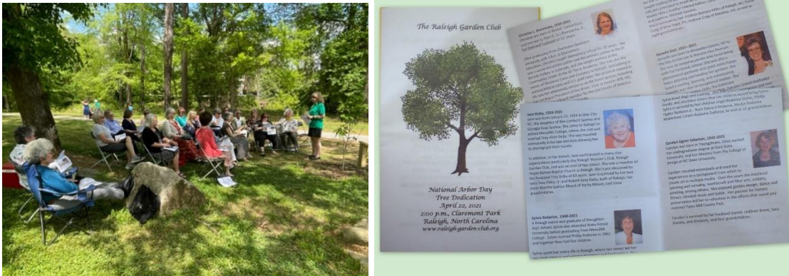
7 - Gathering for the Memorial Tree Dedication on Arbor Day, and the keepsake program.

The planning of which kind of tree and the location is a team effort between the Parks Dept. and RGC’s Civic Improvement Chair. The actual planting is done by the Parks staff and the Club holds the memorial ceremony on Arbor Day. Each member is honored, and a printed program is given to the family members who attend. The Club donates $1000 to Raleigh Parks Dept. in support of this project. Planting trees teaches stewardship of our natural resources and caring for the environment for generations to come.