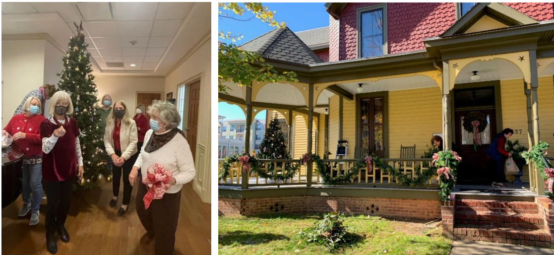
10 - Decorating Transitions LifeCare Hospice (left), and tidying up the Polk House for Christmas

Another goal accomplished is educating our members on the Christmas decorating traditions of the Victorian era. The Victorians created Christmas decorating as we know it – from Christmas cards to the decorated tree. They used their imagination and things found in nature to decorate their trees, which inspires us today to re-connect with our natural world and the GCNC goals of conservation and appreciation of Nature.