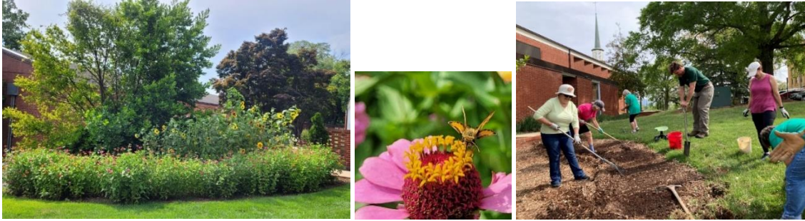
6 – The new garden in summer, a hummingbird moth, and prepping the new garden

Tree Planting in Honor of Arbor Day To promote civic beautification of our parks, RGC has a tradition of planting trees for club members who have passed away during the previous year. This year we planted a grove of dogwood trees, Cornus florida ‘Cherokee Princess,’ six in all! They were planted in Claremont Park in Raleigh with the cooperation of the Parks Dept. A ceremony dedicating the trees and honoring our members was held on Arbor Day. The family and friends of the honorees were invited to join Club members and a Parks Dept. representative.