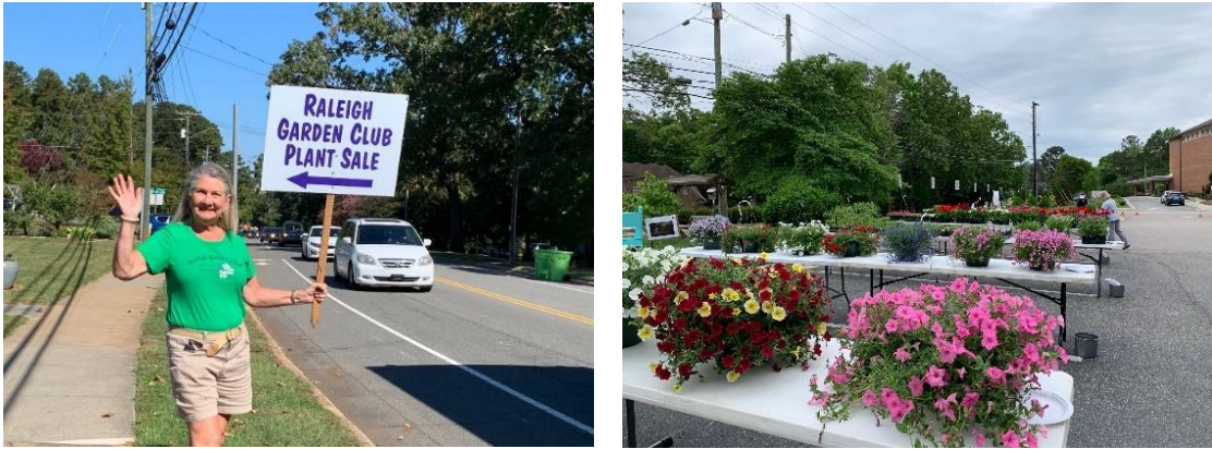
3 - Working the Plant Sale

plants to order. The nursery grows the requested plants in greenhouses for the sale. The sale has three goals: 1) opportunities to mentor both new members and the general public on what grows well in the area, 2) Expanding our educational outreach with our vendor partners like The Mushroom Guy, who taught about organic gardening, and 3) raising money for the Community Donations fund. This year the spring plant sale raised $1418 and the fall plant sale raised $1328.