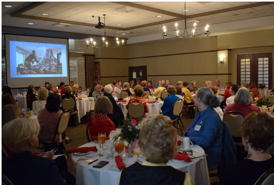
12 - A meeting of The Raleigh Garden Club presented by Juniper Level Botanic Garden

By the numbers, the Club raised and distributed $7185 in Community Donations, completed on 18 environmental and civic improvement projects, presented 24 educational programs to our members, and our sponsored Youth Garden Club girls. But the true benefit of our efforts epitomized the value of garden club: fulfilling the goals set out by GCNC by beautifying our communities, celebrating our garden traditions, and uniting members of our Club in activities that were fun to help grow our gardens and green our community. We are pleased to submit RGC as GCNC Club of the Year for larger Clubs. Thank you for the opportunity to share our story.