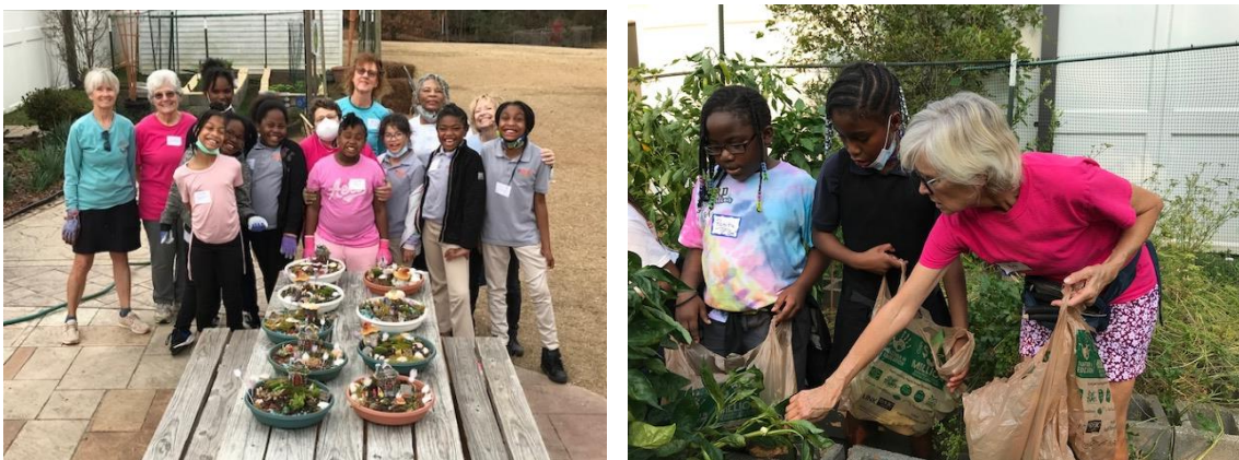
11 The Rosey Girls Garden Club planting dish gardens, and harvesting from the vegetable garden.

Due to COVID 19 safety precautions, we had to meet with the girls outside this year, skipping January and February because of the cold.