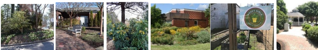
4 - The 6 public gardens RGC maintains, in order as listed above.

The study of gardening is furthered by working in other gardens from one's own, and RGC supports and maintains six public gardens: The Charlotte Hilton Green Park, a pollinator garden at Dix Park, A Sanctuary Garden at the Transitions LifeCare Hospice, the Winter Garden at the JCRA, the Rosey Girls Vegetable Garden at the Boys and Girls Club, and the Martha Franck Fragrance Garden which is a GCNC Legacy garden located in Raleigh.