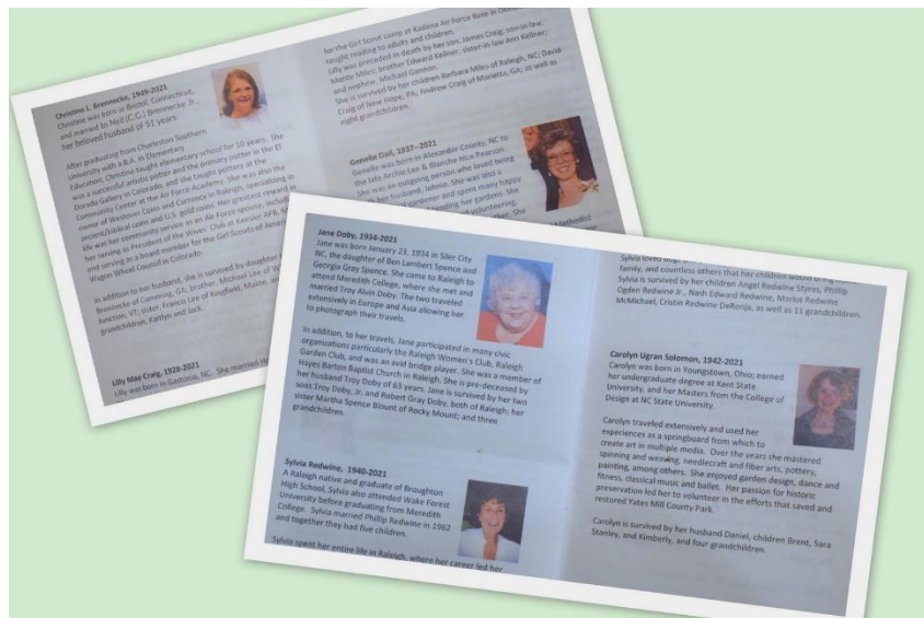
3 - Our Program is a keepsake for the friends and family of our honored members, each of whom has a tree planted for Arbor Day