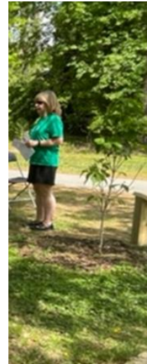
1 - A mature specimen of the Cherokee Princess dogwood and one of our newly planted ones, with its dedication plaque.

The preparations for the Memorial Service on Arbor Day included calling friends of each honoree in the Club and finding out about their family and close friends. Invitations are sent, and a program prepared as a keepsake for each attendee. Club members are invited at the meetings and by our newsletter and website. This year, because our trees were along the Greenway, balloons and signs welcomed attendees and guided them to our ceremony. Chairs were ordered for the day, and a little prayer said for sunny weather.