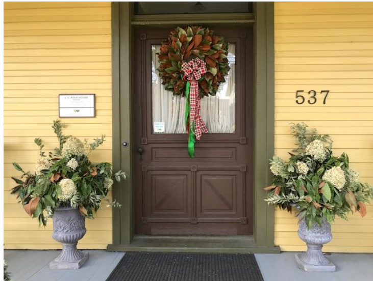
2- The entrance to the Polk House -- all dressed up for a Victorian style Christmas.

A second goal is educating our members on the Christmas decorating traditions of the Victorian era. The Victorians created Christmas decorating as we know it – from Christmas cards to the decorated tree. They used their imagination and things found in nature to decorate their trees. It inspires us to re-connect with our natural world meeting an objective our garden club holds dear. Besides... it was fun and inspiring to keep our decorating traditions alive.